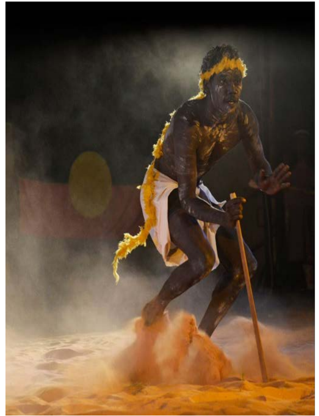
Djuki Mala performing at DanceSite 2013 in Borroloola, NT.

In 2013, the Chooky Dancers changed their name to Djuki Mala . Djuki is the adopted word for 'chook'. There is no 'ch' in Yolngu language – the closest approximation is the 'dj' sound, and many words end with a vowel sound. This vowel ending is commonly added to English words that are adopted for introduced animals or concepts – hence chooky/djuki from 'chook', an introduced domestic bird. Mala means a group or set of people who share a common feature. The change of name has therefore not affected the meaning of the group's name, however it does reflect that the members of the group do not speak English as their first language.