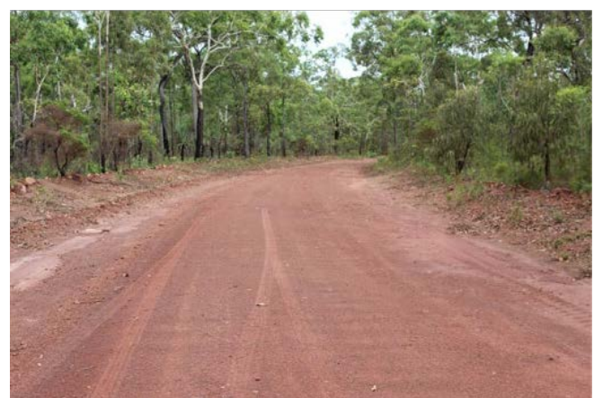
Elcho Island: (top) Mission Beach, (centre) basketball court at Galiwin'ku school, (bottom) road near Galiwin'ku.

Activity: Find Elcho Island on Google Earth. Find Galiwin'ku and Gäwa, then search the whole Island to see how many of the outstations you can find.